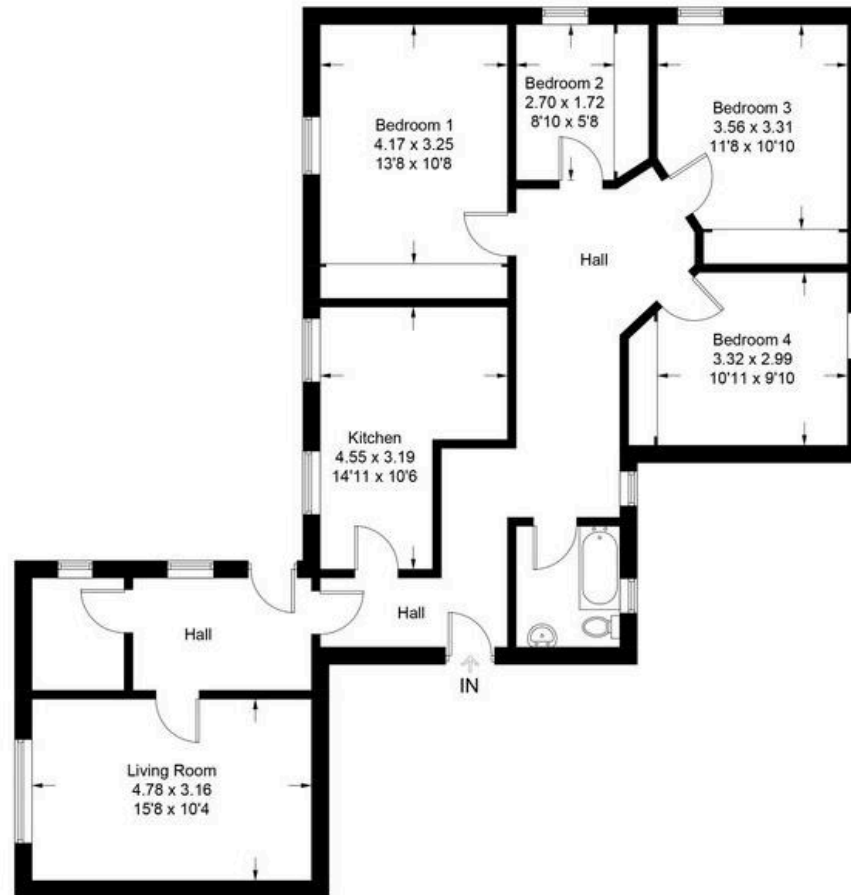
Illustration for identification purposes only, measurements are approximate, not to scale. (ID1105000)

Approximate Gross Internal Area = 111.1 sq m / 1196 sq ft