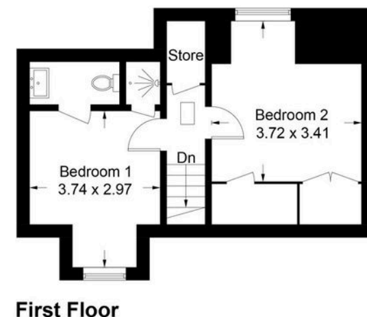
Illustration for identification purposes only, measurements are approximate, not to scale. floorplansUsketch.com © (ID1123242)